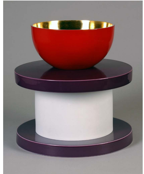
Ettore Sottsass, Vase Diane , 1994/96. Glazed and decorated pâte nouvelle porcelain. Manufacture et Musée nationaux, Sèvres, 2011.D.3316.