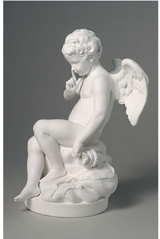
Etienne-Maurice Falconet, L'Amour menaçant (Threatening Love) , 1758/61. Manufacture de Sèvres. Soft-paste porcelain biscuit. Manufacture et Musée nationaux, Sèvres, MNC 27724.1.